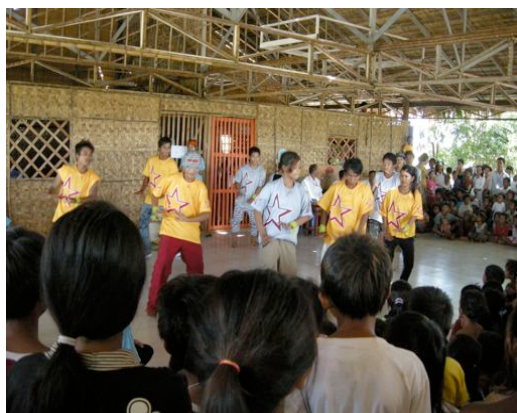
International Children's Rights Day festival in Andong, Cambodia's largest IDP camp. June 1, 2008.

Networking and solidarity between the Centre on Housing Rights and Evictions (COHRE), Dey Krahom leaders and LICADHO Canada resulted in a Musical Resistance concert in the Dey Krahom children's art centre in October 2008. Over 100 people gathered to watch performances by community artists as a response to continued attempts by a local developer to destroy the centre. The event gained media exposure and the developer has not resumed efforts since..