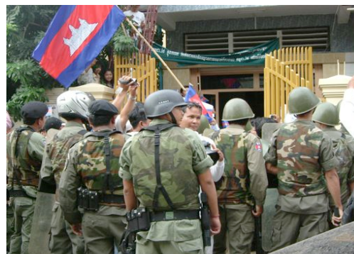
LICADHO Canada staff accompanied union workers facing riot police for having a support rally without permission. Phnom Penh, August 2008.