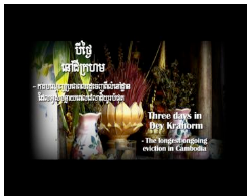
Three Days in Dey Krahorom. This documentary looks at threats and intimidation in land evictions.