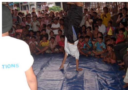
Dey Krahom children perform in a Musical Resistance Concert to create solidarity and prevent the unlawful destruction of their art centre. September 2008.